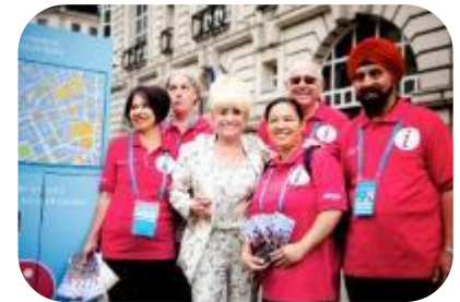
Welcoming the world to London