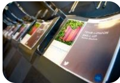
Championing and supporting the third sector