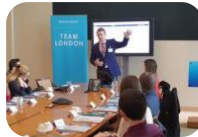
Partnering with business