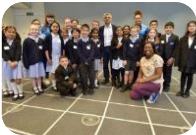
Building the next generation of volunteers