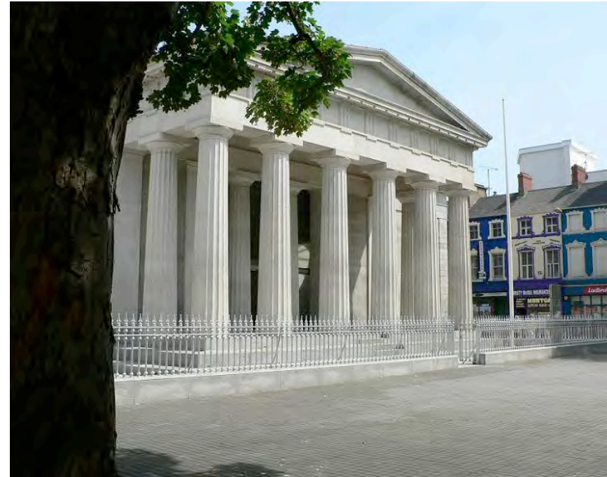
Dundalk Courthouse, Ireland