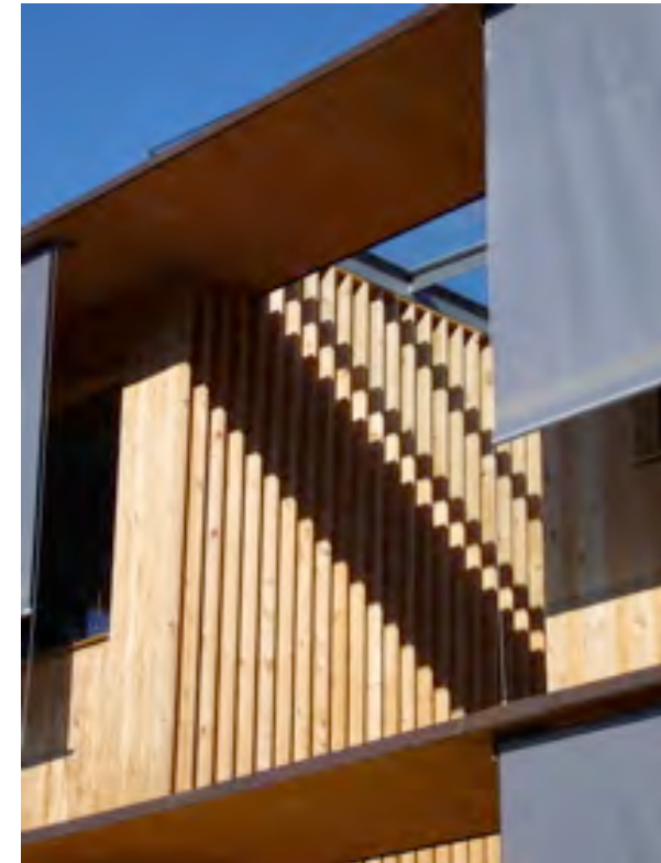
Community Centre, Voralberg, Austria