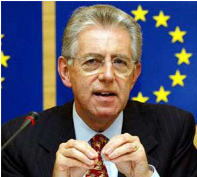
Mario Monti Commissioner Competition

« Social housing is fully in line with the basic objectives of the EC-Treaty. It is a legitimate element of public policy and as it is limited to what is necessary it is in the interest of the Community that social housing is supported ».