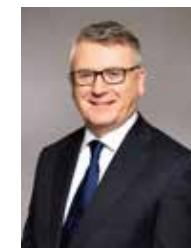
Minister for Labour, Employment and the Social and Solidarity Economy, Grand Duchy of Luxembourg

Our agenda is ambitious, and the EESC's experience as the institutional platform through which the European Union can access the relevant socio-economic stakeholders at the European, national and regional levels will be an invaluable source of inspiration. The economic and social councils, including Luxembourg's ESC, are also active links in this chain.