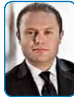
Joseph MUSCAT Prime Minister of Malta in his keynote speech during the conference

“We need essential structural reforms to ensure competitiveness. The time has come for this as we now need to unleash our people’s potential and not stifle that potential under excessive regulation. Our economies are crying out for breathing space. We need to responsibly liberate and liberalise our investment strategies.”