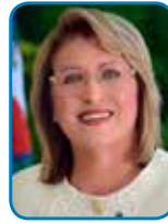
HE Marie-Louise COLEIRO PRECA President of Malta in her keynote speech during the conference

“The private sector contributes to well-being by incentivising investments in new learning and education and by encouraging the acquisition of vital skills. The private sector is a sphere of action where the empowerment of individuals and businesses fosters greater diversification within our economies. That is why we need to encourage governments to stimulate private sector investment by focusing special support on community level and local approach.”