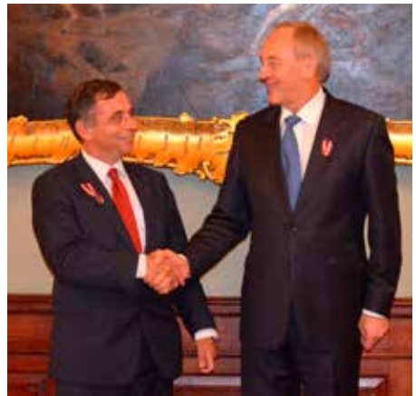
From the left: Henri Malosse, EESC President, Andris Bērziņš, President of Latvia

More directly, links have also been forged with local politicians such as the Mayor of Jelgava – a city of 63 000 inhabitants – who has been awarded the title of most business-friendly politician, and also with students from Riga Technical University, with whom Mr Malosse held discussions on the vital importance of matching training to labour market needs in the fields of science and the new technologies.