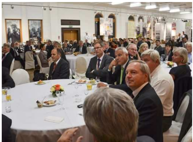
Employers' Group members at the dinner in the Solidarnosc museum