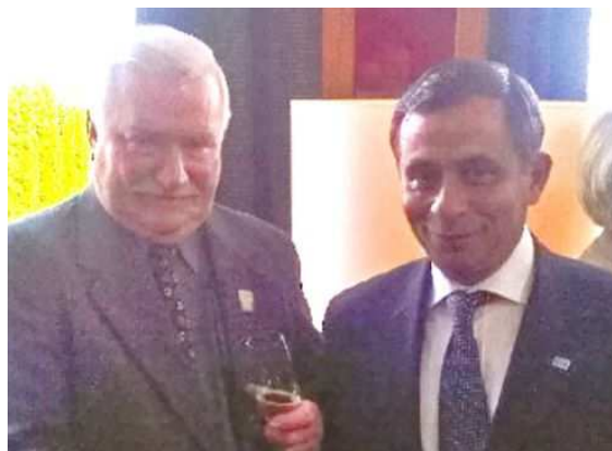
Lech Wałęsa, Henri Malosse

The ceremony at the monument of the Gdansk Shipyard was a tribute to all Polish citizens who gave their lives so that Europe could be liberated and unified. By listening to the testimony of the heroes of the strikes of 1980 in the exact place where the agreements that legalised Solidarność (Solidarity) were signed, we accomplished our duty of memory. This duty of memory goes beyond the summer of 1980 in Gdansk, even if these events were undoubtedly precursors and initiators of the fall of the Berlin Wall and the Iron Curtain nine years later!