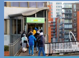
Access to essential services