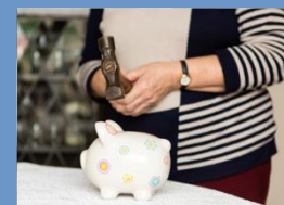
Old age income and pensions