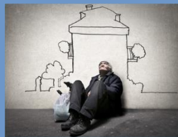
Housing and assistance for the homeless