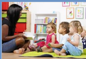
Childcare and support to children