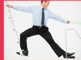
Secure and adaptable employment