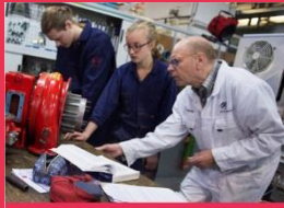
Education, training and life-long learning