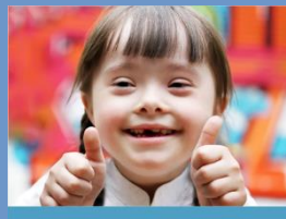
Inclusion of people with disabilities