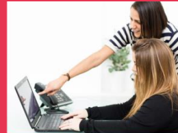
Active support to employment