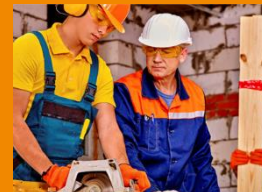
Safe work environment