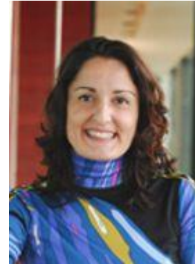
Anna Maria DARMANIN President of the Single Market Observatory (SMO)

The aim of this report is to assess the whole issue of self-regulation and co-regulation in the context of the European Union and think about, in particular, what qualitative criteria are needed for a reliable and effective implementation of these participatory standard-setting instruments, which illustrate the role that civil society can actually play in the legislative process.