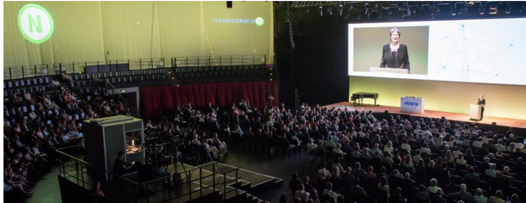
Presentation of report at RNE Annual Conference