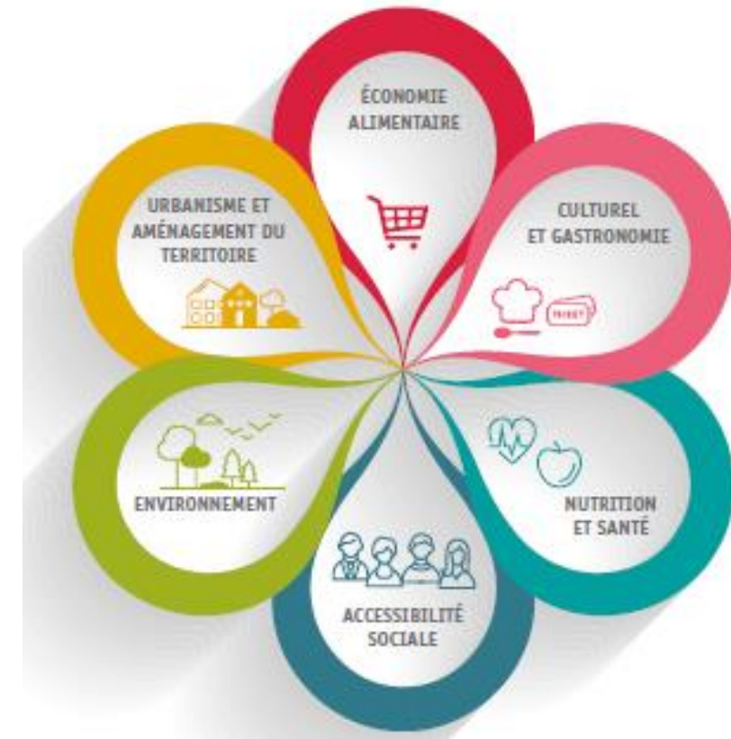
The six food sectors (RnPAT)