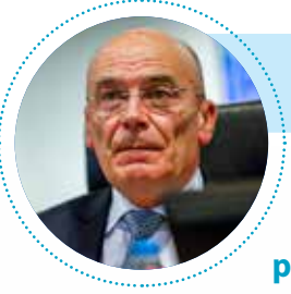
Pietro Francesco De Lotto, President of the CCMI

Access to water, water quality, water use, and consumption needs to be given the corresponding political attention. Following this hearing, the EESC will start preparing a set of own-initiative opinions, covering the economic, social, environmental and geopolitical aspects of water. The water dimension must be embedded in every policy area. The way forward can only be together – with joint and coordinated actions at regional, local, national, and European levels.