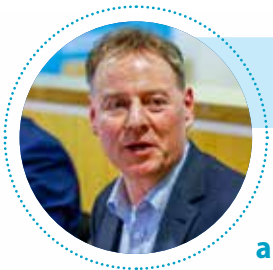
Oliver Loebel, Secretary General, EurEau

Secondly, the water infrastructure must be properly surveyed and maintained, with a minimum of 2% of the whole system needing to be renovated each year. This includes both public sewer systems, but also the private networks which link them and are often forgotten about. Finally, he discussed how we must address the energy and water nexus. In the drive towards energy neutrality by 2040, we will need to develop and install additional renewable, sustainable energy sources for providing the energy needs of water purification systems and water treatment plants.