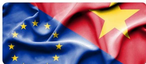
EU Domestic Advisory Group under the EU-Vietnam FTA

Following its 14th meeting on 6 November and the cancellation by the Vietnamese side of the