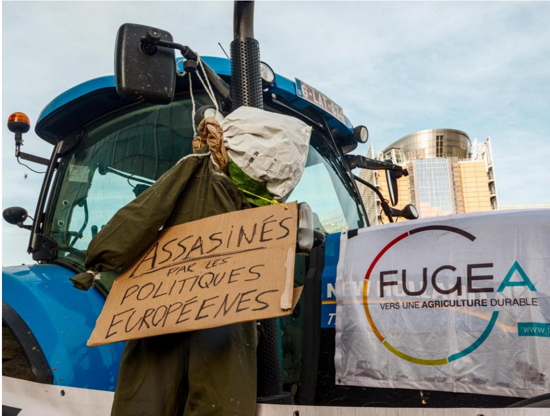
11/13/24 – Anti-EU-Mercosur FTA farmers Demonstration