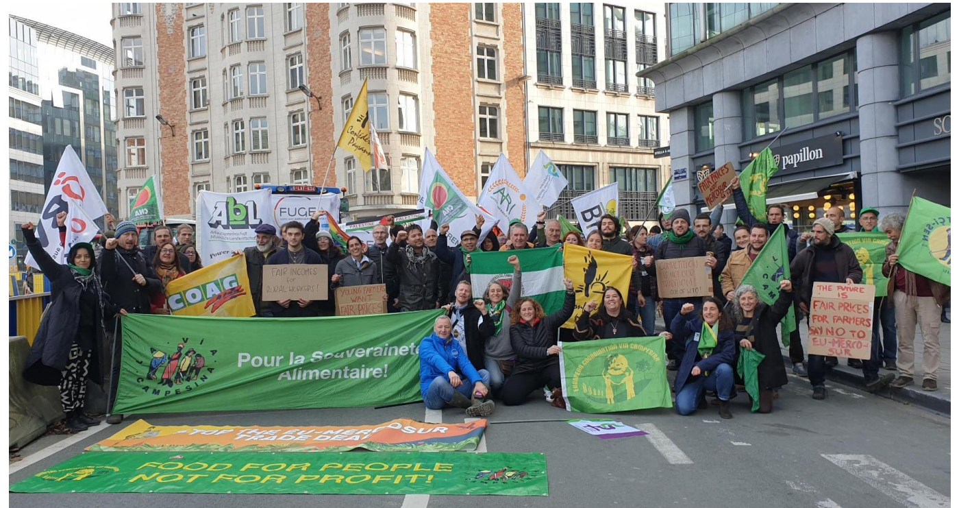
11/13/24 – Anti-EU-Mercosur FTA Peasant Demonstration