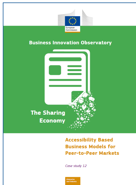
Business Innovation Observatory Sept. 2013