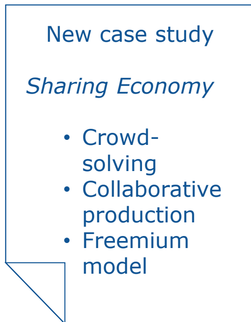
Business Innovation Observatory Summer 2015