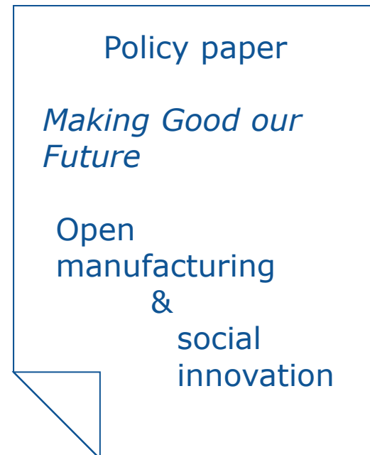
Social Innovation Europe May 2015