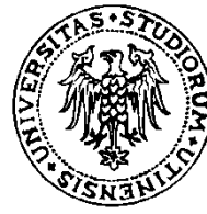
University of Udine